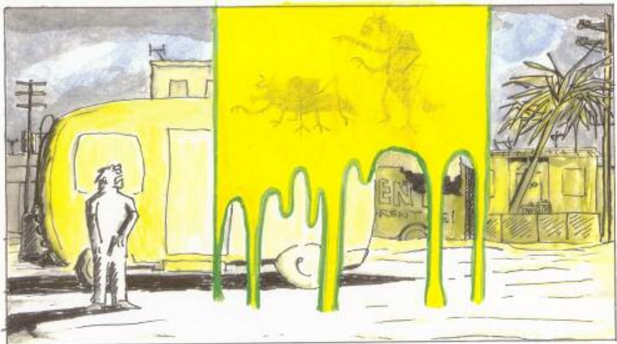
ALIENS DISAPPEAR IN ENERGY BEAM.

Talking excitedly among themselves, they enter the ENERGY BEAM and vanish. Distraught, WALDO runs into the Trailer.